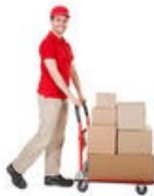
EXHIBIT HALL HOURS